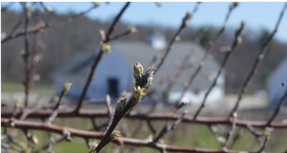
Apple trees budding at Prospect Hill Farm, Harvard, MA

Community Harvest Project (CHP) is a 501(c)3 non-profit organization operating in Grafton and Harvard, MA. Our mission is to build healthy and engaged communities through volunteer farming and nutrition education. CHP is dedicated to improving access to healthy fruits and vegetables for those who need them most.