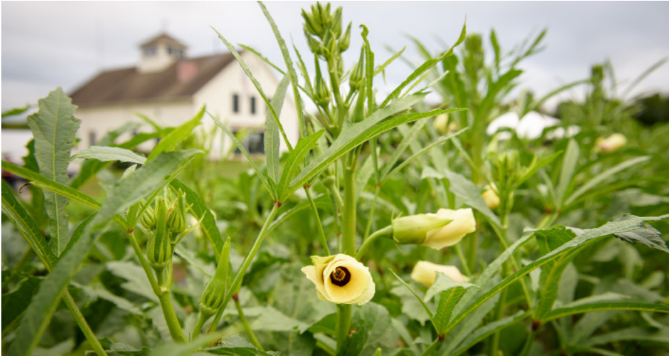
Okra flowering in front of Brigham Hill Community Farm, North Grafton, MA

Community Harvest Project (CHP) is a 501(c)3 non-profit organization operating in Grafton and Harvard, MA. Our mission is to build healthy and engaged communities through volunteer farming and nutrition education. CHP is dedicated to improving access to healthy fruits and vegetables for those who need them most.