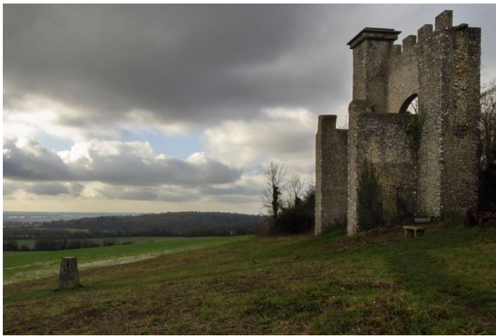
The Folly and view to the South- East