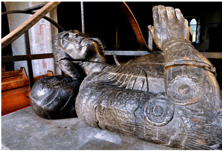
Detail of the effigy of Sir Anthony St. Leger (d. 1539) in St. Mary's Parish Church, Slindon. It is the only wooden effigy found in a Sussex Church