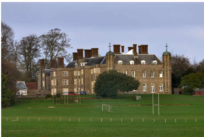
Slindon College, formerly Slindon House, but now an independent day/boarding school for boys