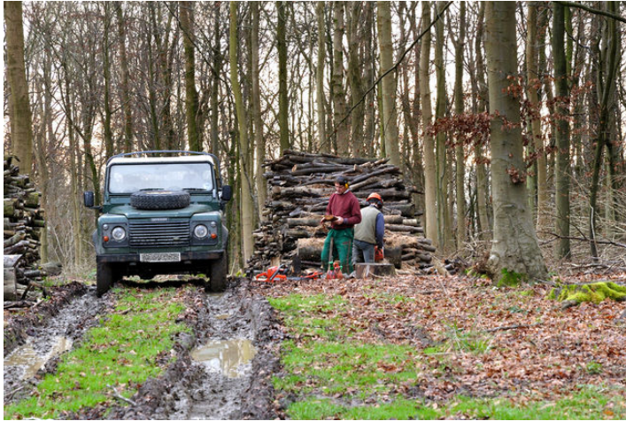
Forestry operations on Nore Hill