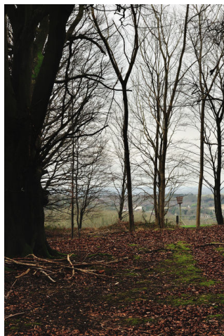
Beacon Fire Basket on Nore Hill