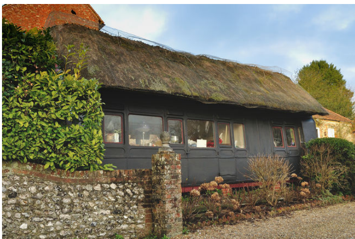
A Slindon Oddity: the thatched 3rd Class Railway Carriage built circa 1874!