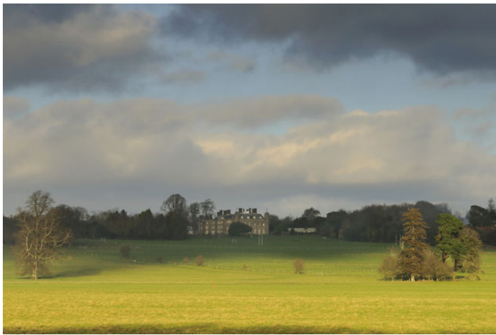
Slindon Park with Slindon House (now Slindon College) in the background