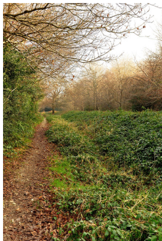
Footpath between Waypoints 7 and 8 showing the medieval ditch and bank of the Deer Pale