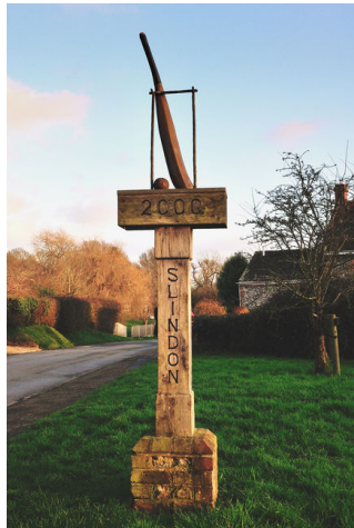
Slindon, West Sussex: the birthplace of cricket