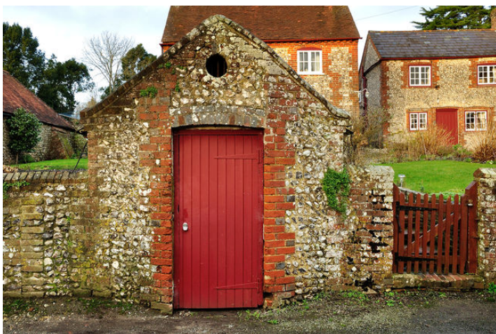
Slindon's 19th Century Lock-up