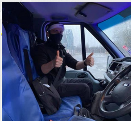
We are still out working, with new COVID safety measures in place for our crew whilst in our vans.

February is the last official month of winter, so at least we have longer days and warmer months to look forward to!