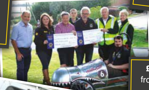
£1,000 raised from the Coleby Downhill Challenge