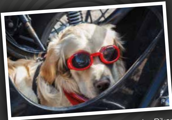
Bisley the Biker

More than 150 bikers and marshals helped to raise more than £2,000 for us by taking part in our first ever Ride to Save Lives. Participants rode a 115-mile route from Waddington to Gunthorpe and back raising money along the way as well as raising awareness of the vital work of the Lincs & Notts Air Ambulance.