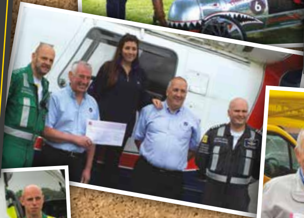
Bulley Davey chose the Lincs & Notts Air Ambulance as its charity this year for in-house fundraising. They presented a cheque to us for just over £1,000