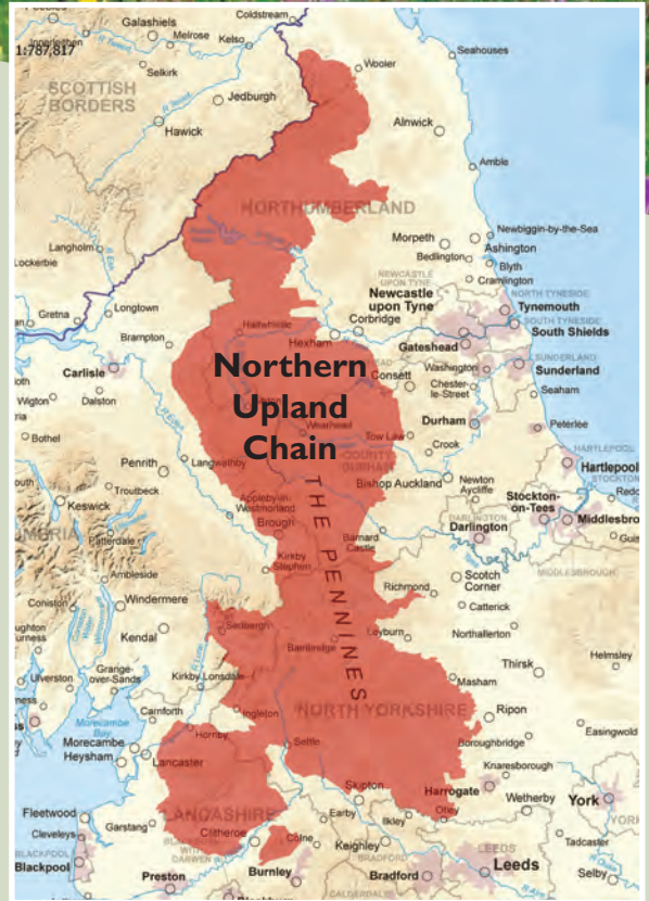
(Northumberland National Park)

The Northern Upland Chain Local Nature Partnership was established in 2012, and includes over 50 organisations. It covers four nationally-designated landscapes: Northumberland National Park, North Pennines AONB, Yorkshire Dales National Park, Nidderdale AONB and Forest of Bowland AONB.