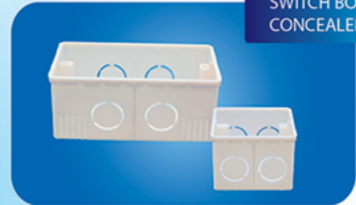
SWITCH BOX CONCEALED