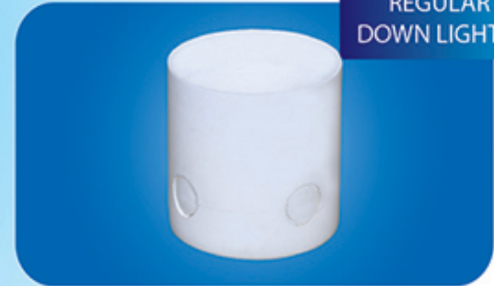
REGULAR DOWN LIGHTER