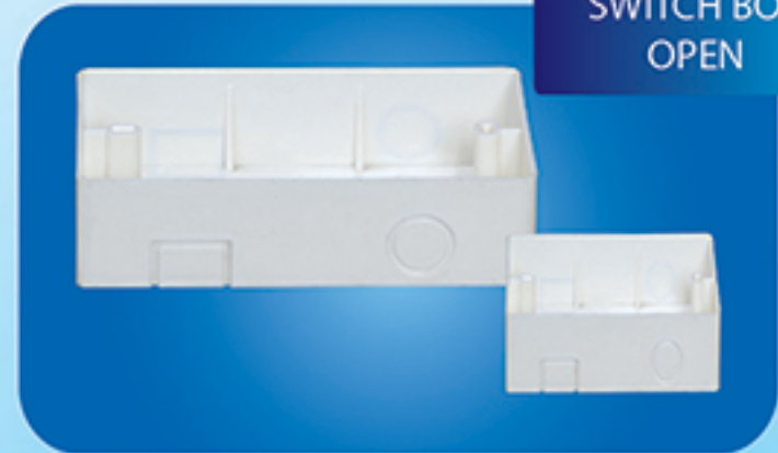
SWITCH BOX OPEN