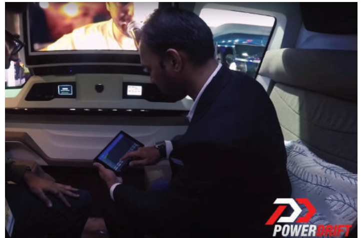
Coverage by: Power Drift