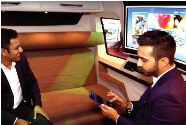
Coverage by: Bloomberg Quint