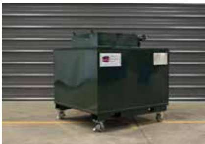
FUEL, LUBE, WASTE OIL, DEF