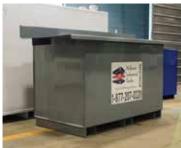
WORK TOP TANKS