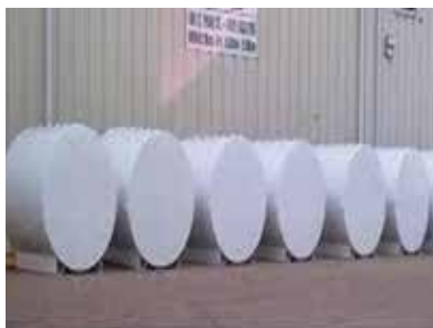
ROUND OR RECTANGLE