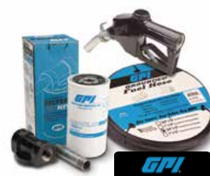
PUMPS & ACCESSORIES