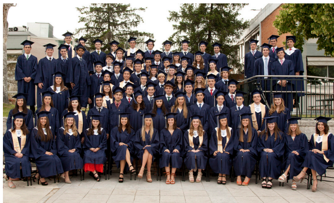
*Bold print indicates 2019 class enrollment