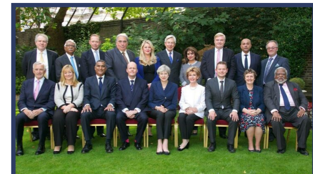
With the Prime Minister and fellow Conservative MEPs

So far we are proving shrewd negotiators and I am confident we will soon move to the important