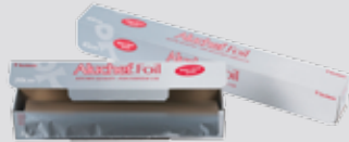
26. ALUCHEF KITCHEN FOIL (11 MICRON)

Code: Size: T10230H 30cmx300m T10245H 45cmx300m