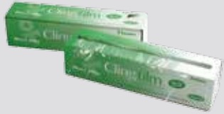
25. PVC MULTI-USE CLING FILM

Wipe clean boxes. Integral cutter blade can be safely contained when not in use. Very low migration. Each cutterbox individually wrapped. Permeable so food can breathe.