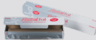
27. ALUCHEF PREMIER FOIL (13 MICRON)

Code: Size: T11330 30cm x75m T11345 45cm x75m T11350 50cm x75m T11360 60cm x75m