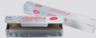
28. ALUCHEF HD FOIL (17 MICRON)

Code: Size: T11130R 30cm x75m T11145R 45cm x75m T11150R 50cm x75m T11160R 60cm x75m