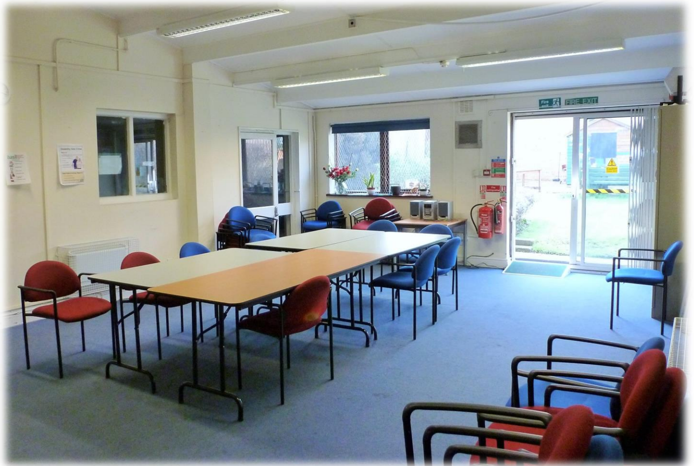
The Garden Room