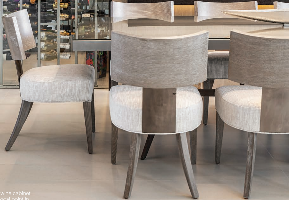
A custom built glass wine cabinet serves as a second focal point in the dining room.