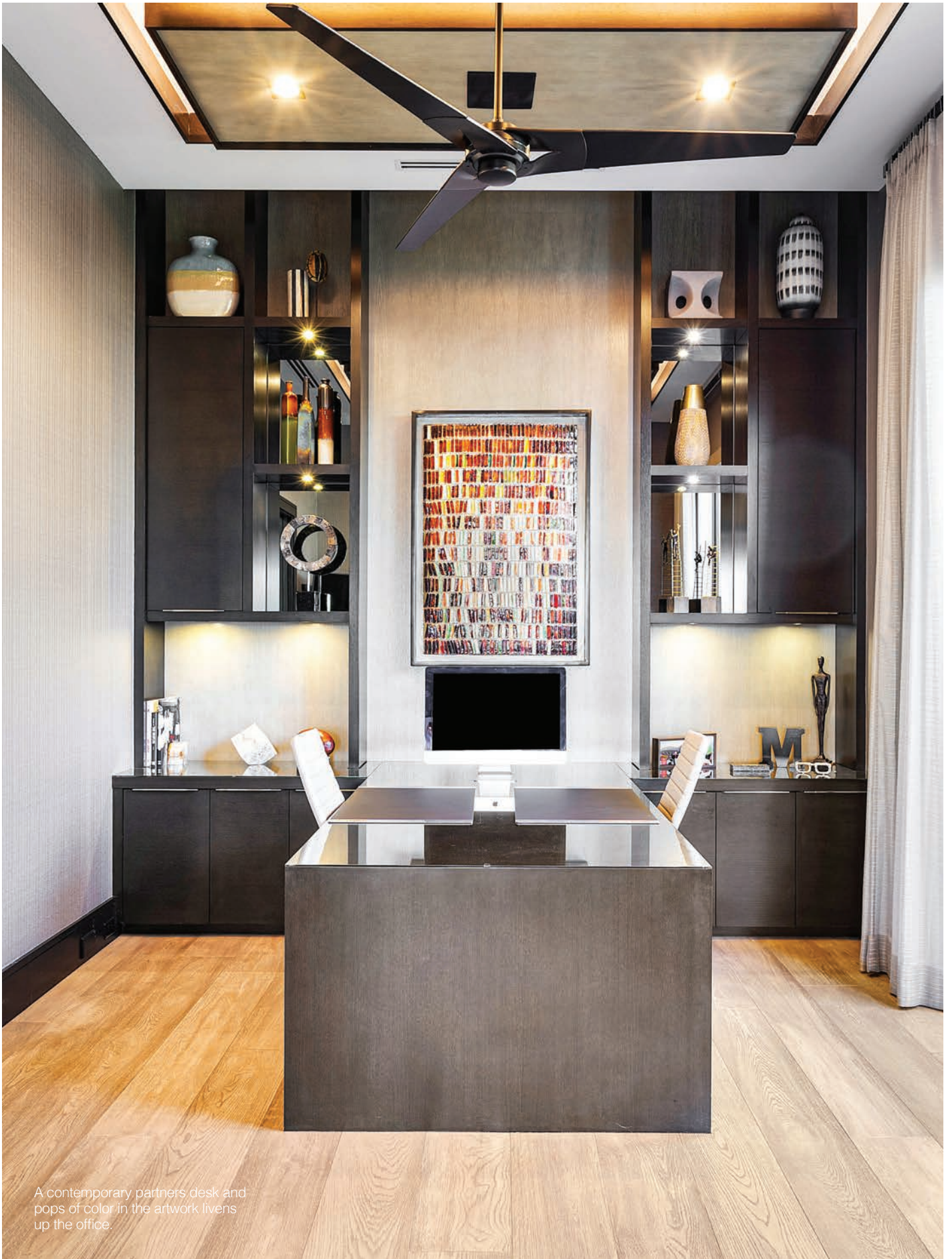
A contemporary partners desk and pops of color in the artwork livens up the office.