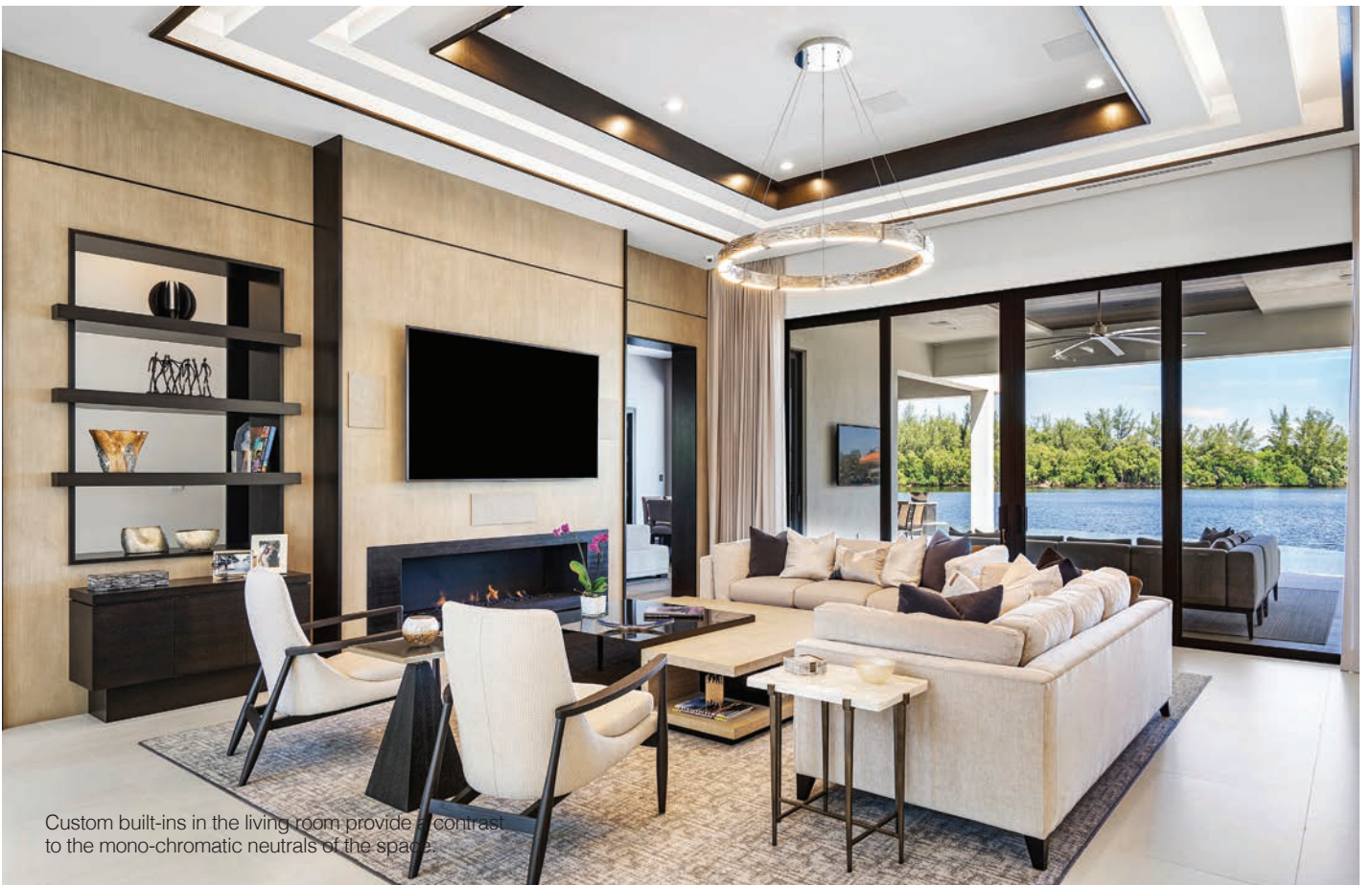
Custom built-ins in the living room provide contrast to the mono-chromatic neutrals of the space.