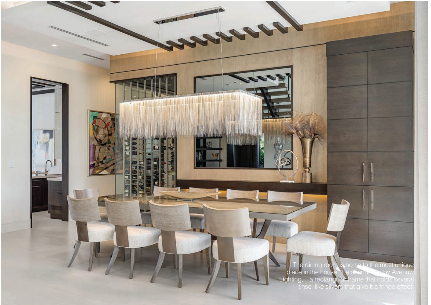
The dining room is home to the most unique piece in the house, the chandelier, by Avenue Lighting, —a rectangular frame that holds several tinsel-like slivers that give it a fringe effect.