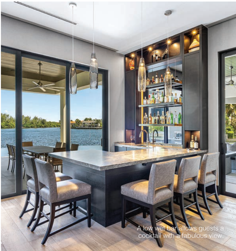
A low wet bar allows guests a cocktail with a fabulous view.

Since the debut of the TV show The Jetsons , Americans have dreamed of technologically advanced homes. With the press of a button, doors would lock or unlock, food would be delivered on a conveyor belt, and so on. The problem is that modern and high tech often conjure up images of a cold, harsh space. Can a house feel “homey” when embedded with technology? What if there were a way to marry technology with the warm, inviting ambience of a traditional home?