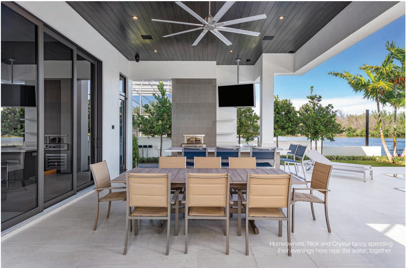
Homeowners, Nick and Crystal fancy spending their evenings here near the water, together.

in squares that are 26 by 26, so I proposed to Nick and Crystal to do three of the squares. We all decided that the best route would be to customize it. Our fixture was customized locally through Beautiful Things, and it ended up being 72 inches long by 26 inches wide.”