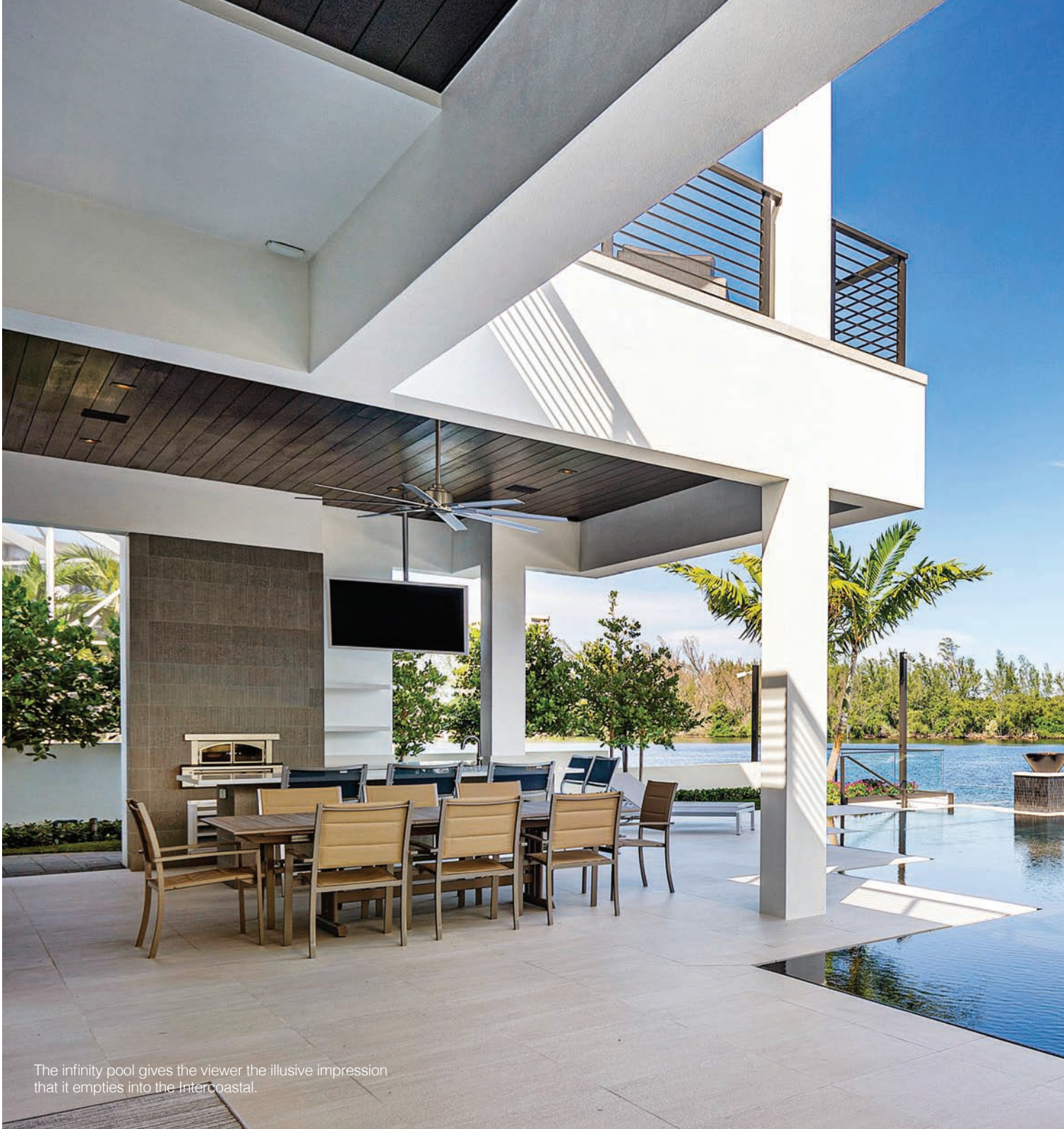
The infinity pool gives the viewer the illusive impression that it empties into the Intercoastal.