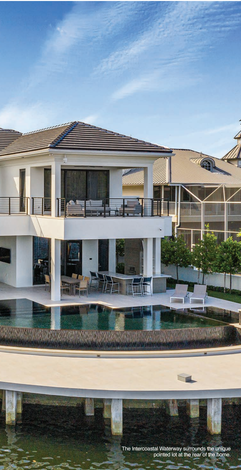
The Intercoastal Waterway surrounds the unique pointed lot at the rear of the home.

research. Work with a team you trust—that has a proven track record and can show you more of what will be rather than what has already been.”