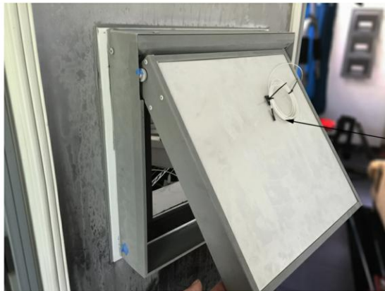
A1. Internal Freezer Temp Sensor (F)