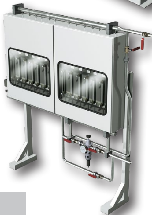
Flow control cabinet