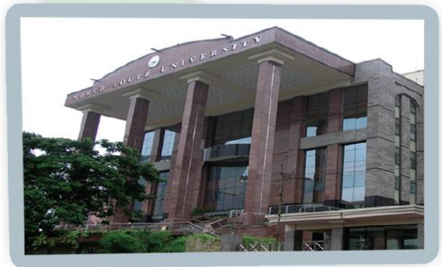
Construction of North South University (Part) Employer : NSU