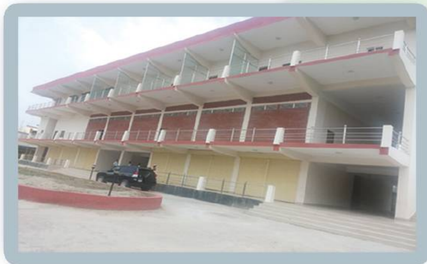
Construction of Auditorium Building, Norsingdi. Employer: Local Govt. Engg. Department. Completion year : 2014.

Plot No-43/2, Senpara Parbata, Mirpur, Dhaka Completion year :- 2016.