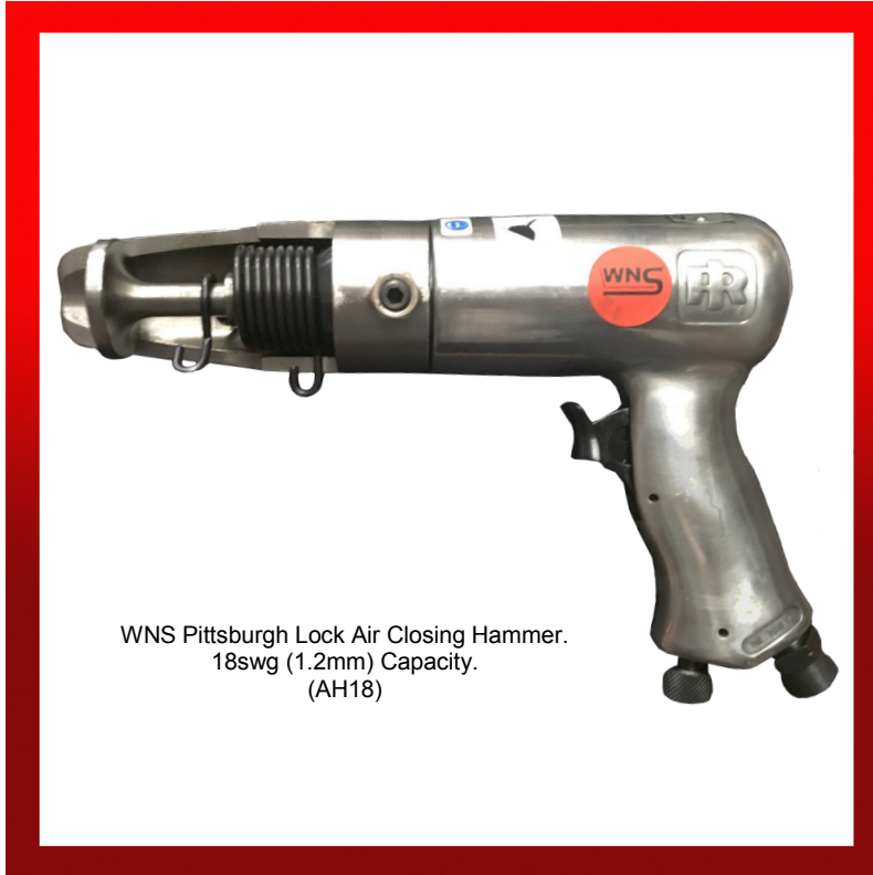
WNS Pittsburgh Lock Air Closing Hammer. 18swg (1.2mm) Capacity. (AH18)

W. NEAL SERVICES LTD 29 Purdeys Way Purdeys Industrial Estate Rochford Essex SS4 1ND ENGLAND