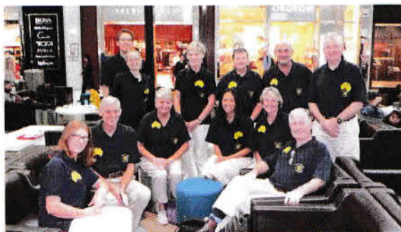
The Rotary Club of West Pennant Hills and Cherrybrook Inc. Committee Reports for 2013 - 2014 Page 11