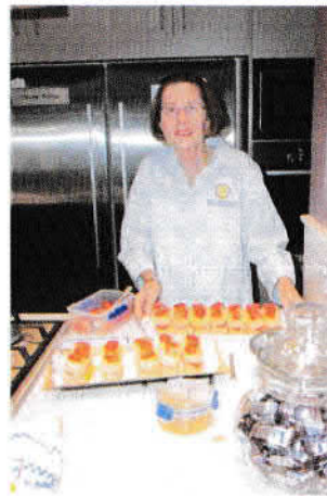
Ronald McDonald House meal

Youth. As usual, we supported a wide range of youth activities, including RYLA, RYPEN, NYSF and RYDA. The two youth nights - when the young people participating, at first tentatively, tell us what their expectations are and then come back afterwards and enthuse about their experiences - were two of the best attended meetings and had a real buzz.