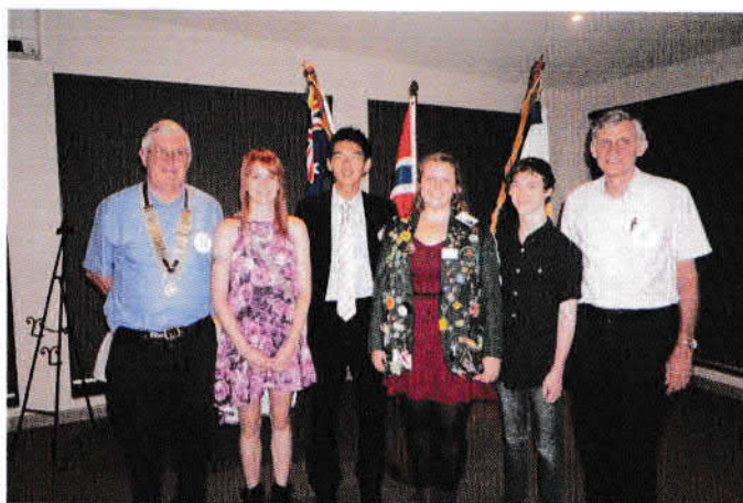
Our youth night