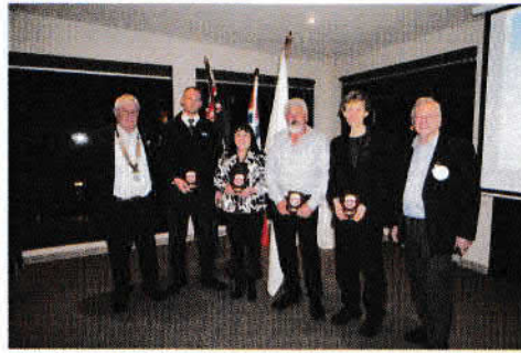
Pride of Workmanship Awards Night