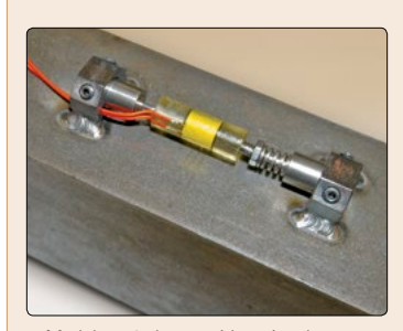
Model 4150 shown with optional arcweldable mounting blocks.