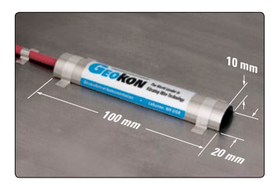
Model 4150 under the Model 4150-1 protective cover plate, with dimensions.