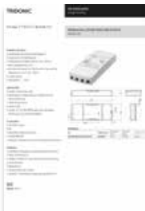
Data sheets available at www.tridonic.com , „Technical data“ menu