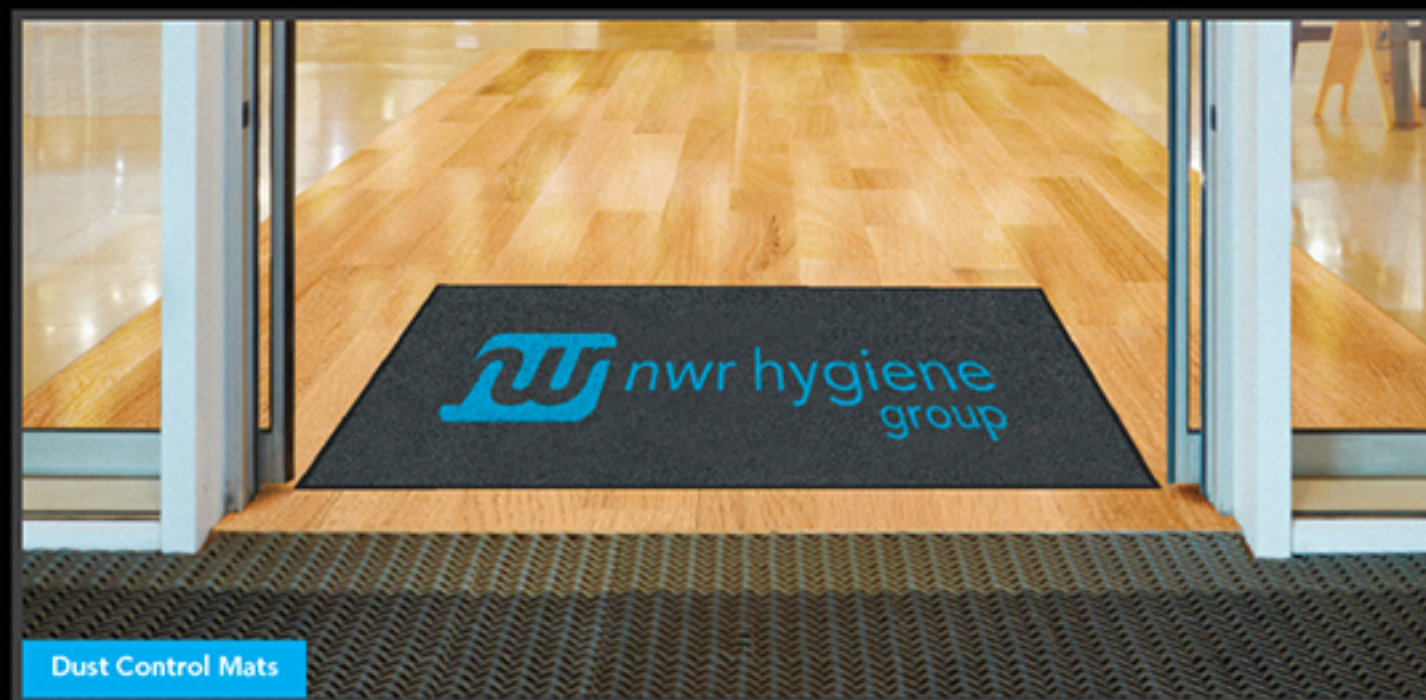
Dust Control Mats

One of our customers even had the children from the nursery draw a picture to be placed on the logo mat and they are extremely happy with the results. We have a wide variety of colours to suit every business.