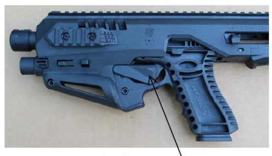
CAA RONI with safety trigger guard

I also write to warn you that ME Technology is now selling an imitation of the original Micro RONI under the name MCK. If you haven't noticed, the MCK pistol carbine conversion kit <u>DOES NOT INCLUDE A TRIGGER GUARD</u>. I believe ME Technology omitted the trigger guard from the MCK to avoid infringing our U.S. and European patents. However, based on my 19 years of military and Special Forces combat experience, and 15 years of design and development experience, I believe the omission of the trigger guard renders the MCK product <u>UNSAFE AND HAZARDOUS</u>. The trigger guard is a <u>VITAL safety</u> component of the authentic CAA RONI and Micro RONI and is designed to prevent an unintended discharge of the firearm while in the pistol housing. The MCK does not include this VITAL safety component. I believe the MCK design is <u>WORSE</u> than designing a pistol holster and leaving the trigger exposed! The omission of a trigger guard is shown in the photographs below.