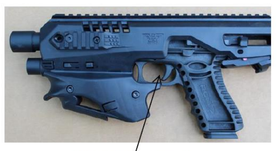
MCK with no trigger guard