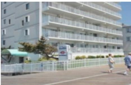
El Capitan, 4 th Street & Boardwalk

"The negotiating power of a large-scale corporation while maintaining a personal touch and attention to detail of a local mom and pop business"