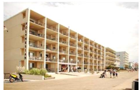
Polynesian, 3 rd Street & Boardwalk