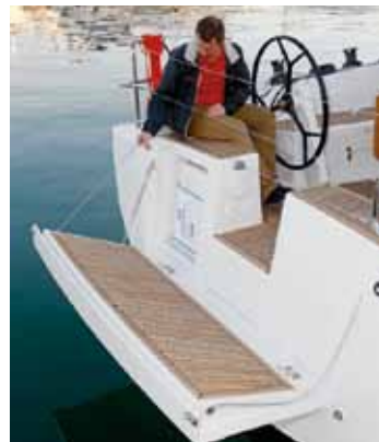
The transom drops and lifts easily and changes the cockpit ambience

We tested over two days in Palma. Day one brought a Force 2-3 and on a flat sea with optional NorLam sails by North, she made 5-6.5 knots close-hauled, at around 30° to the 10-12 knots of apparent wind angle, tacking through 80° True and carrying her speed well. Fetching at 60° to the apparent wind, with 8.5-10 knots across the deck, she logged 6.3-6.8 knots. Broad reaching at 120-140° with the asymmetric spinnaker flying in a meagre 4-6 knots of apparent wind, she glided along at 4.8-6.5 knots. On day two, with a gusty Force 4-5 wriggling through the town, she topped out at 8.3 knots, broad reaching under 'white sails'.