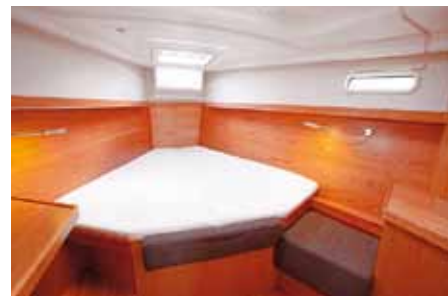
Four opening hatches in the forecabin