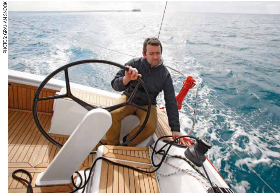
You can hoist, trim and reef from the helm, she's genuinely singlehanded