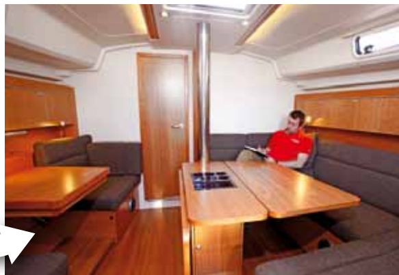
Good LED lighting, deckhead hand-holds, light and ventilation