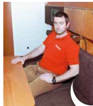
The chart table drops on gas struts to create a second settee for dining eight

Access to the engine and saildrive is good, beneath the companionway steps and through panels in both aft cabins. Seacocks, batteries and transducers are also easy to reach. The calorifier is under the port aft berth, the fuel tank under the starboard aft berth and the water tank under the forward berth. It's not the kind of access you would get with a dedicated 'technical room', but it's pretty good.