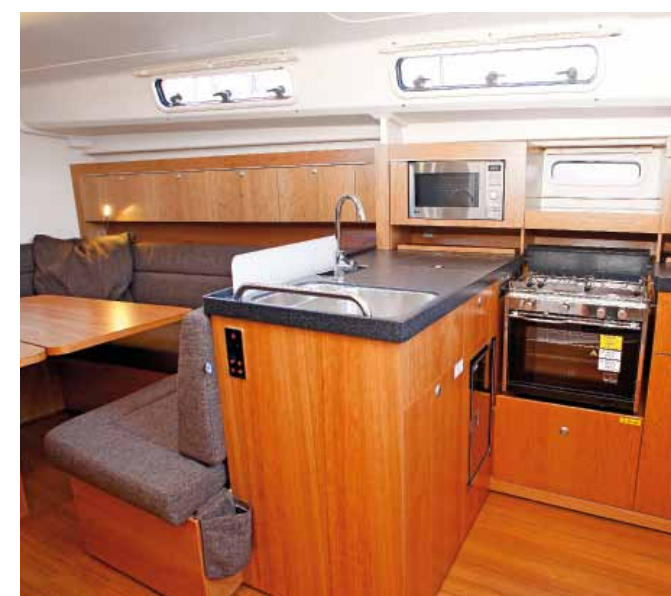
It's a decent galley with a big fridge but stowage is limited