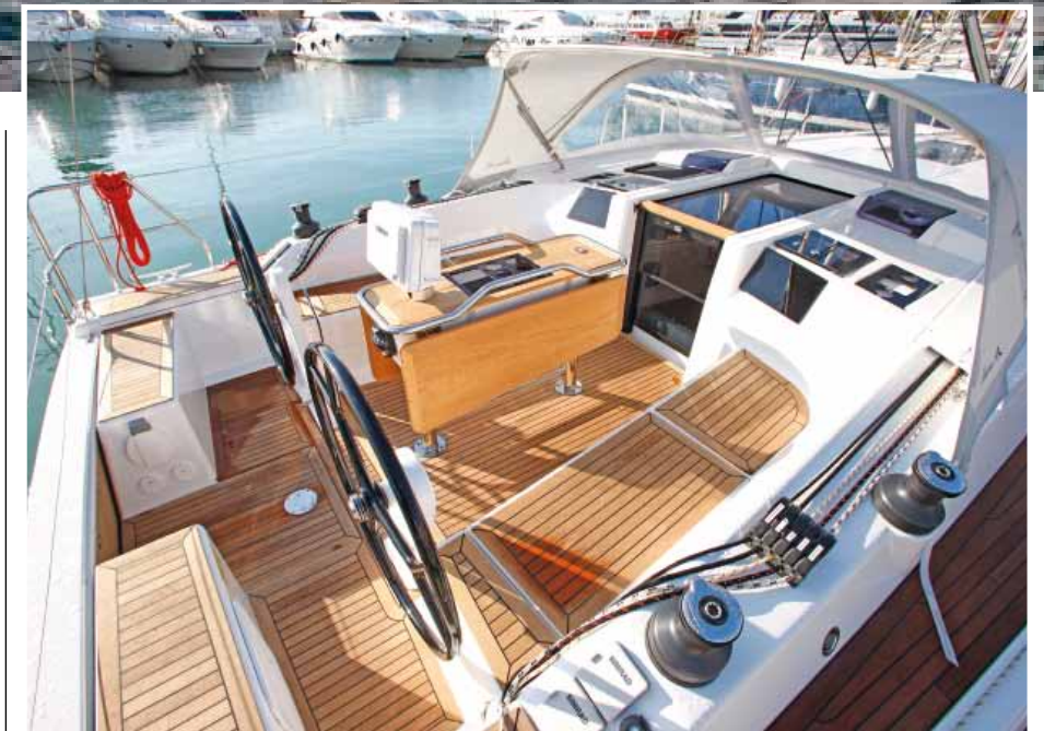
Great bracing, good length benches and lots of stowage under the sprayhood

There's a bow roller and an optional windlass with remote control, the gennaker is tacked onto the bow roller and there's a good-size anchor locker. With shrouds outboard, passage along the sidedecks is easy. Coachroof handrails are short but as everything can be run from the cockpit, do they need to be longer? Below the sprayhood, there are cubbies galore for sunglasses, mugs, mobile phones and books in the space that used to have clutches and halyard winches. Bracing is excellent in the forward cockpit, sheet bins in each quarter keep the aft cockpit tidy and there's an easy walk-through to the folding bathing platform. →