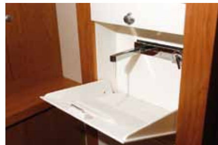
The forecabin has a drop-down vanity unit