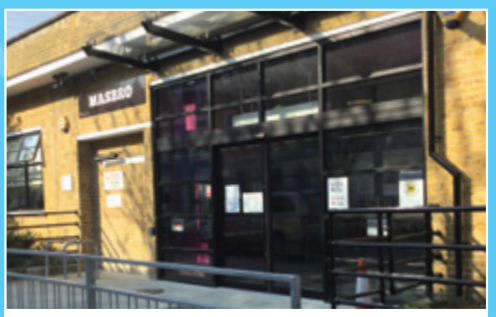
Masbro Children's Centre Milson Rd entrance | 87 Masbro Rd | W14 0LR