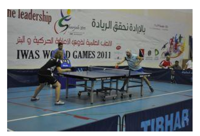
Table Tennis at World Games