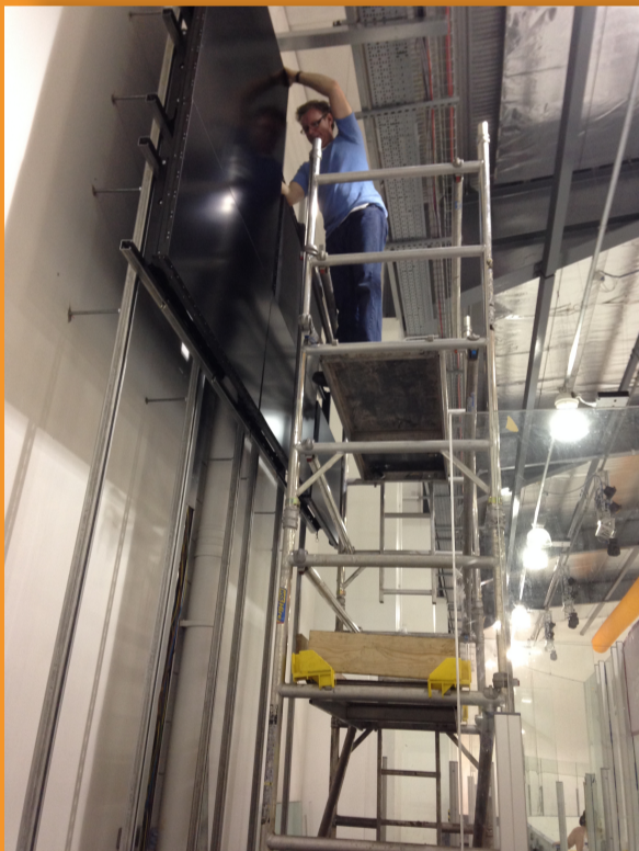
Scenes from the build programme T.L. Narrow access for scaffold T.R. 7 screens up B.L. Protective netting B.R. Control desk and button panel