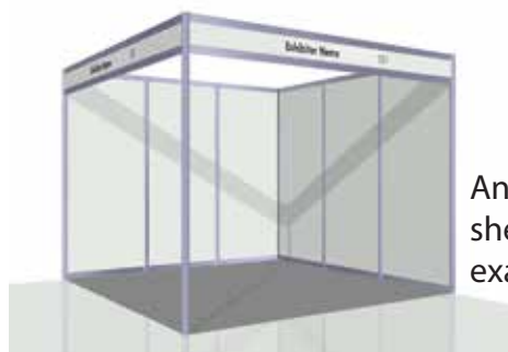
An empty 3x3 shell scheme example.

The banners are supplied with a wooden wall bracket so they can be displayed in your offices between events. We use vibrant, water resistant digital printing inks creating a high impact presentation to entice visitors on to your stand.