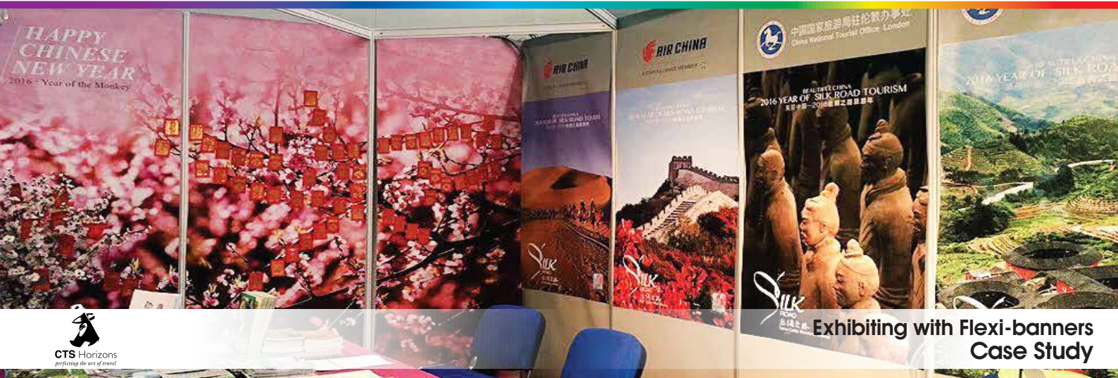
Exhibiting with Flexi-banners Case Study