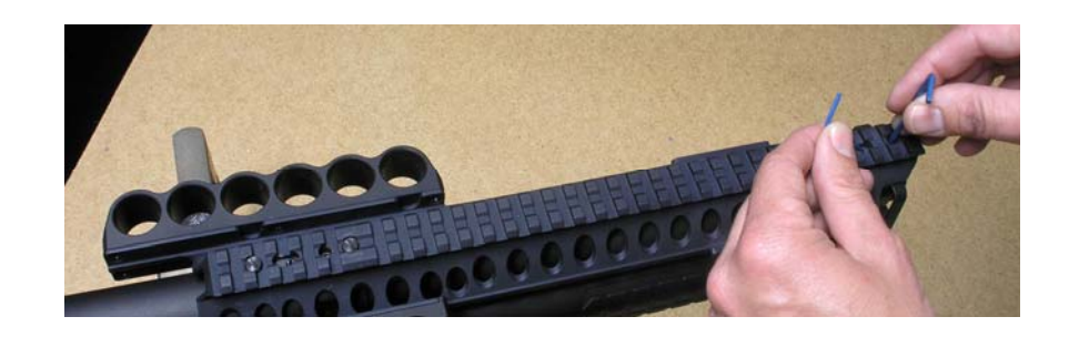
Finally, go back and re-tighten all four of the slotted top rail mounting screws.

Now use the gold hex keys (blue in these photos) to fully tighten the M4 button head screws and the angled set screws.