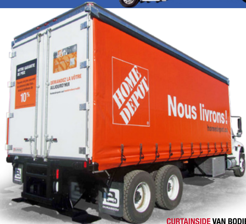
CURTAINSIDE VAN BODIES