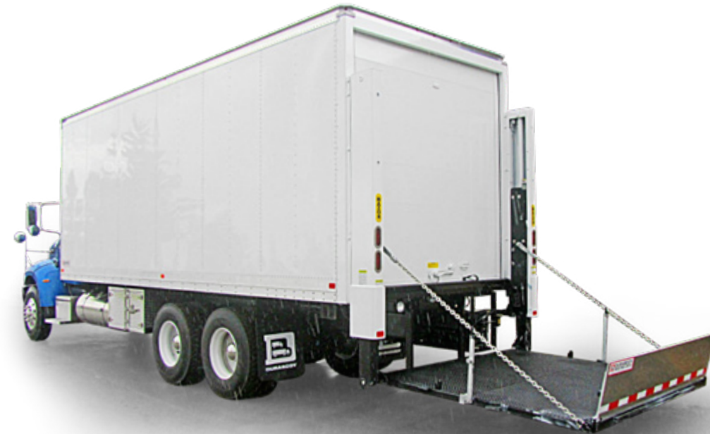
LIFTGATE VAN BODIES