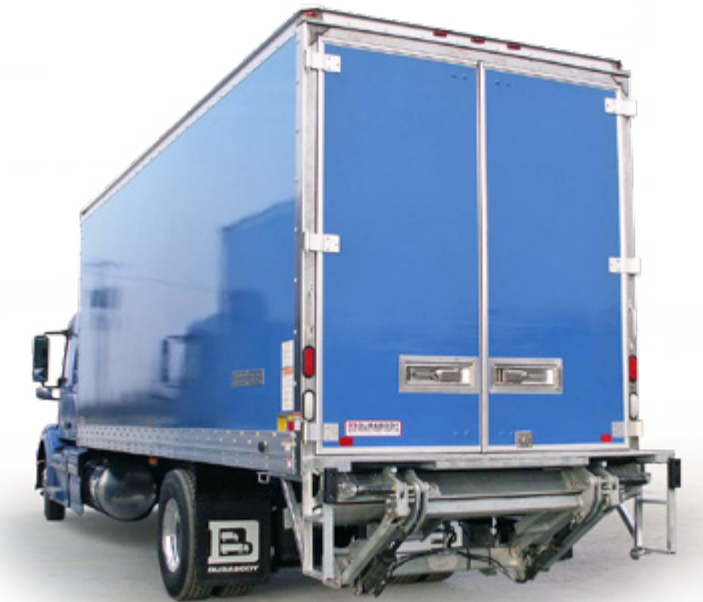
FRP/COMPOSITE VAN BODIES