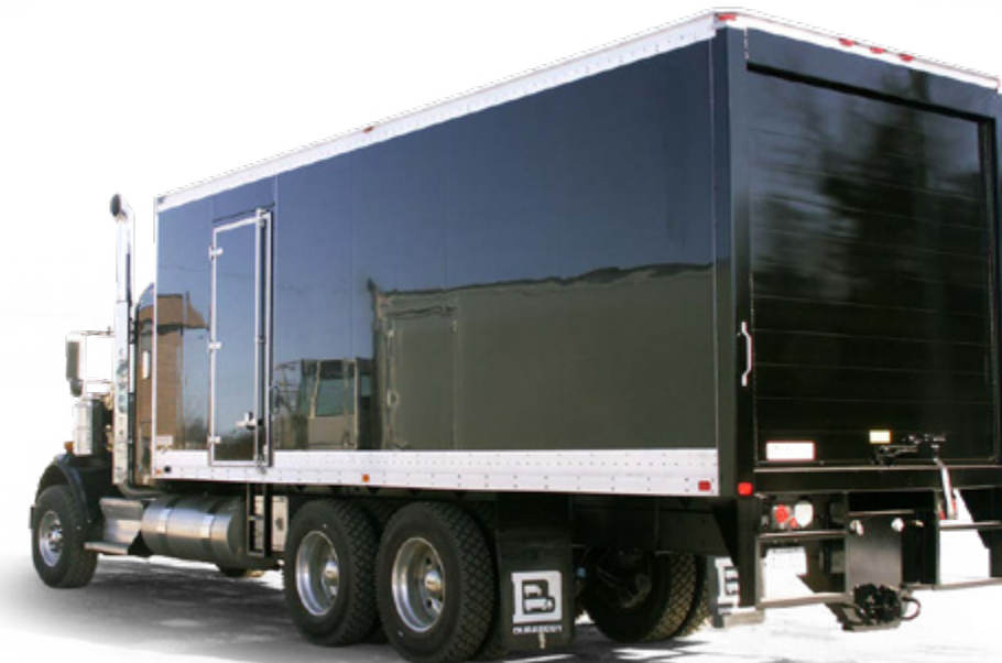
ALUMINUM VAN BODIES