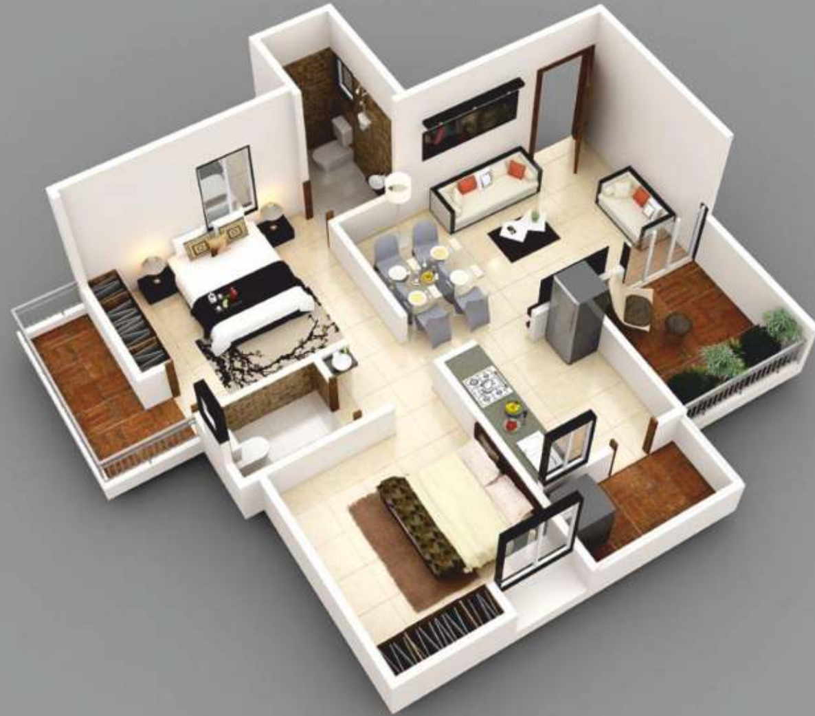
PERSPECTIVE VIEW : 1 BHK