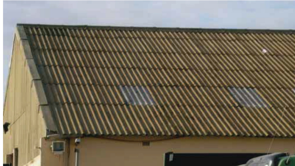
Stripping roof sheets