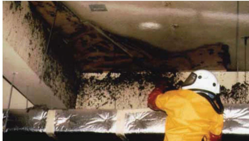
Stripping blue asbestos