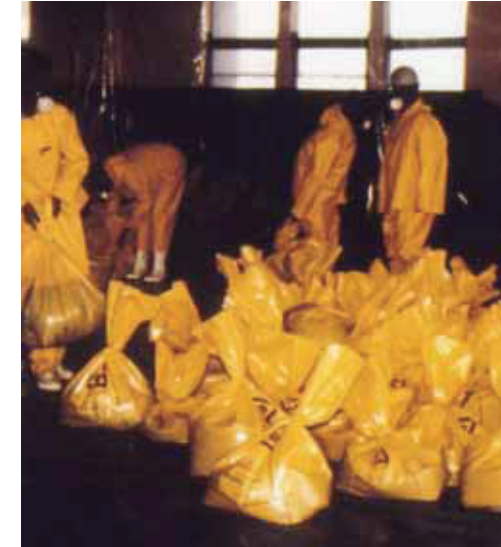
Safe disposal procedures