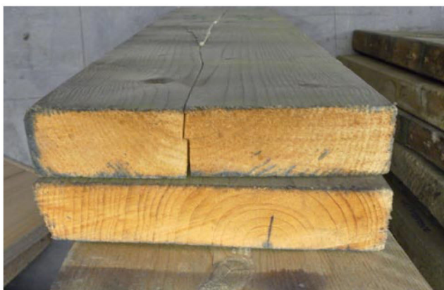
Cut ends need to be coated with preservative

When handling pre-treated timber, wear gloves to prevent splinters and abrasions.