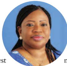
Dr Fatou Bensouda

TIME: Today (1315 – 1415) VENUE: Auditorium