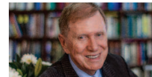
The Hon. Michael Kirby AC CMG Co-chair, IBA Human Rights Institute