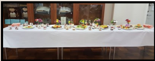
Shavuot celebration at the Cheder 2018

Bronfenbrenner's bioecological model is a theory of educational psychology according to which the interactions between the individuals and their environment shape their development over time. It seems to be of great significance when it comes to the kind of education we are aiming for in our Cheder. This is why we are planning to create opportunities for different kinds of interactions during the year, for example with members of the community, as part of interfaith activities and of course with you, the parents. We see you, the parents, as active partners and we invite you to be involved with our educational activities.