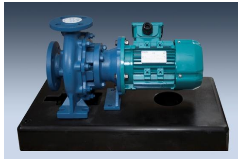
Available in 5 sizes to easily accommodate close-coupled pump and motor combinations.