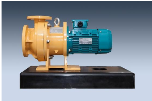
Available in 16 pre-engineered sizes. Ready to accept ANSI/ASME pumps and NEMA Frame Motors.

This scientifically formulated, corrosion-resistant concrete material is designed for casting machine bases and other structural components. It is a blend of pure silicon dioxide ceramic quartz aggregate, high strength epoxy resin and selective additives. Overall, Polymer Concrete Baseplates are considerably less expensive – especially when you factor in the increased reliability and lifetime of your equipment due to their vibration-resistant and corrosion resistant properties.