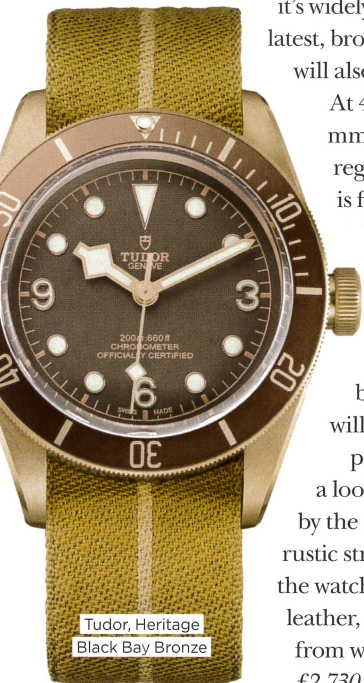
Tudor, Heritage Black Bay Bronze

At 43mm, it is two mm larger than the regular models and is fitted with Tudor's new, in-house manufactured MT5601 automatic movement. The bronze alloy case will take on a unique patina with age, a look complemented by the two appropriately rustic straps supplied with the watch: one of gnarled leather, the other made from woven jacquard. £2,730. tudorwatch.com