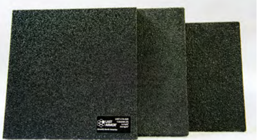
LAST Armor aircraft panels

Since its debut in Opertation Desert Storm in 1991, LAST Armor has protected thousands of combat air and land vehicles. Today it is installed in over 40 different aircraft and in 16 allied countries around the world. LAST Armor is used by the armed forces, U.S. Military, foreign allies, commercial OEMs, and law enforcement agencies.