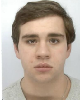
Source: Passport NFC chip