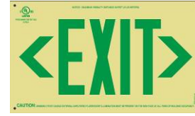
Using directional chevrons to both left and right

Note: The adhesive backing used in the directional chevrons is a product that complies with the Standard for Marking and Labeling Systems - UL 969.