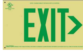
Using a directional chevron to the right