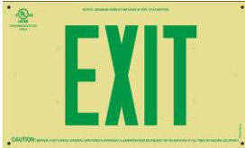
Without the use of the directional chevrons

The sign is supplied with two self-adhesive green color directional chevrons that can be used to show the direction of travel to the exit as necessary in the possible options shown below: