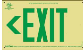
Using a directional chevron to the left