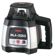
Automatic Rotating Laser