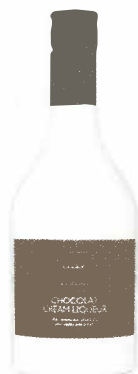
Chocolat Cream Liqueur, £25, Hotel Chocolat