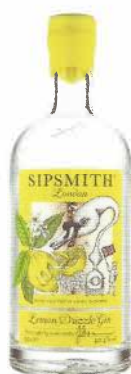
Lemon Drizzle Gin, £25, sipsmith.com