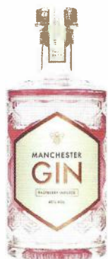
Raspberry Infused Manchester Gin, £35, Debenhams