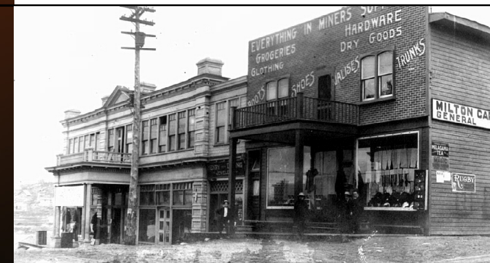
Opera House Block, Cobalt