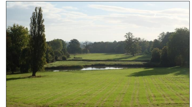
3. East view to the Lake

Cross the forecourt and access the small raised terrace through the wooden gate. Continue around the Hall to the north side and walking along the gravelled terrace above the Croquet Lawn note the view to the north (4). The vista was here when Brown arrived, but he changed the planting, making the Wilderness Grove more informal in appearance. He also added 'clumps' of trees in the distant fields to draw in the wider countryside.