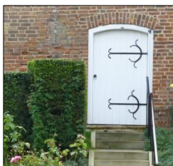
9. Walled Garden

Walk up the drive and through the stone archway (2). The walled garden (9) is to your left, with an entrance through a door at the end of the hedge.