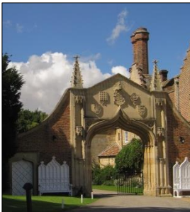
2. Stone Archway

The work included making the previous design less formal and creating the Lake and view to the east from the front of the Hall. The other long views out to the surrounding countryside are typical of Brown in style, but