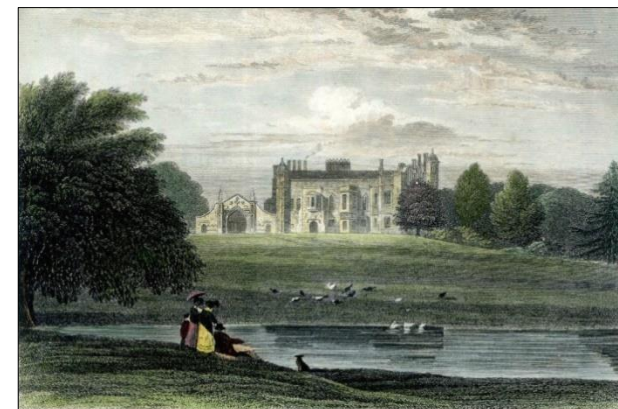
1. Madingley Hall and ornamental lake in 1824

Madingley Hall is an elegant country house built in the 16th Century and owned by the Hynde - and later Hynde Cotton - family until 1871. In 1861 Queen Victoria rented the Hall as a residence for Edward, Prince of Wales whilst he studied at Cambridge. The Hall, with grounds and farmland, was sold to the University of Cambridge in 1948 and is now a continuing education and conference centre.