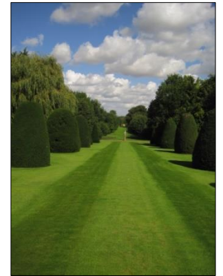
4. North Yew Avenue

Follow the gravel path to a T-junction and then turn right. The path takes a circuit 'all around' the lawns (5) and is in the same location as Brown created it. At the point where the path passes the end of the Yew Avenue (4) there is a gate and stile to access into the Wilderness Grove (6).