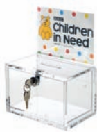
New Classic A6®