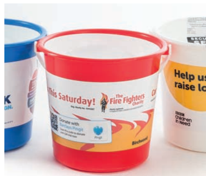
Collectors' Bucket Packs