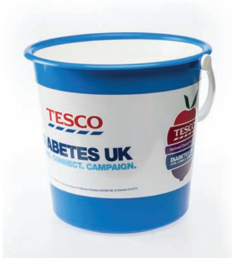
Collectors' Bucket Packs