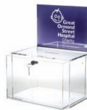
New Classic A4® Polydrum Cylinder®