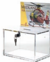
New Classic A5®