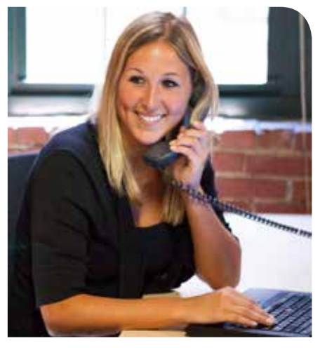
reviewed frequently and remain effective and fair

improving payment practices so more invoices are paid on time. Also the introduction of 'cheque imaging' means cheques will be cleared by banks faster.