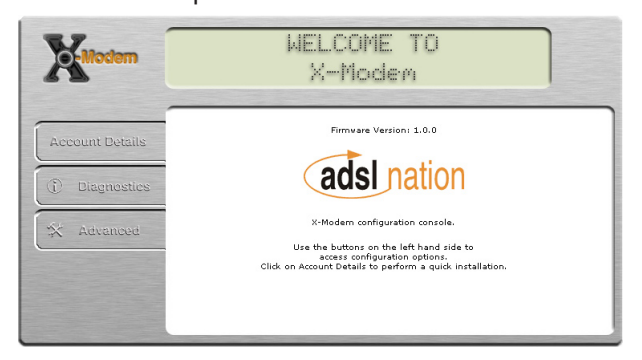
Click "Account Details" to begin set-up.

The X-Modem M3 comes pre-configured for use on a standard BT phone line in the UK.