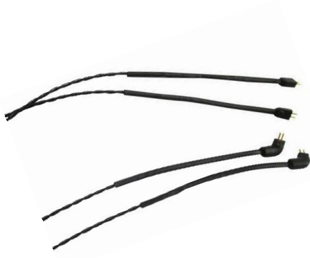
Figure-of-Eight Twisted In-Ear monitor cable formed from durable TPE insulation materials with robust Kevlar reinforced Tinsel conductors. Fitted with straight or angled 2 pin gold-plated earphone connectors and a gold-plated 3.5mm stereo audio connector, Stainless-steel stiffeners are fitted to allow the cable to be formed around the ear. Construction and special coating stop sweat migration and cable discolouration. A slider allows the cable to be held to the neck line.