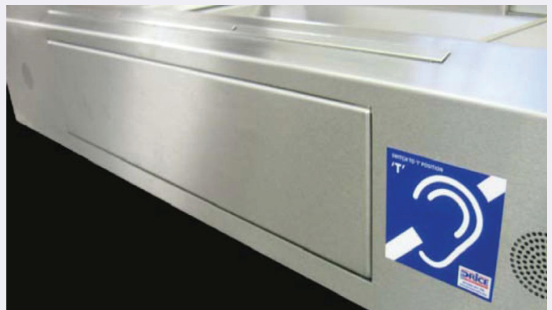
SUITABLE FOR EXTERNAL USE