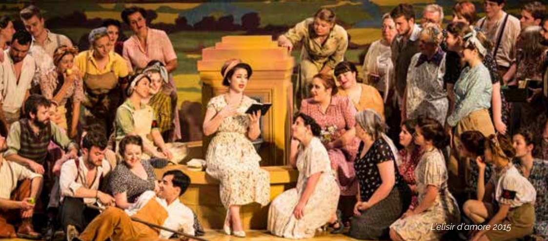
L'elisir d'amore 2015