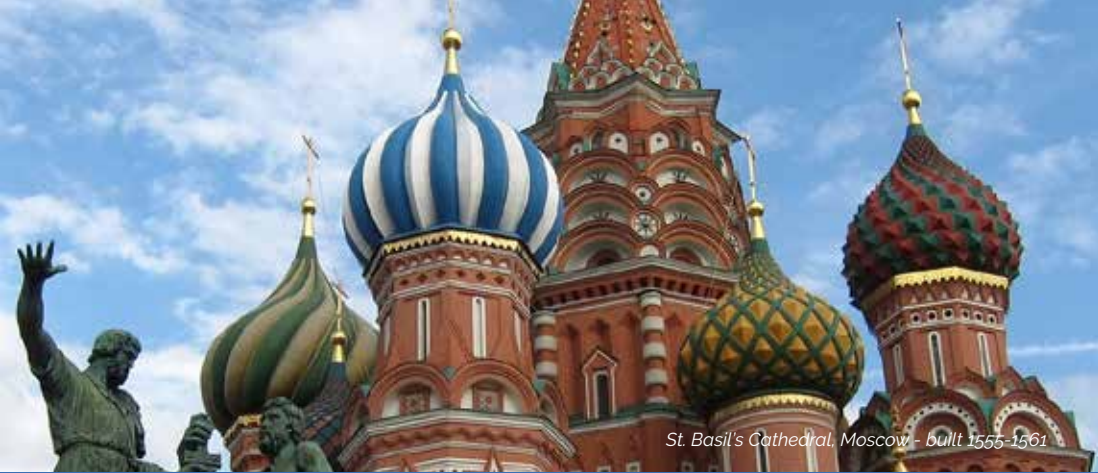
St. Basil's Cathedral, Moscow - built 1555-1561