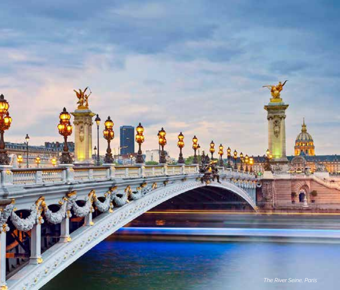
The River Seine, Paris