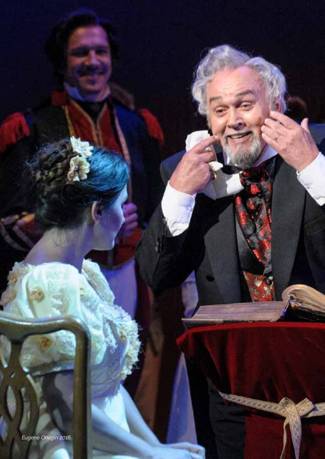
Eugene Onegin 2016